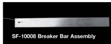
SF-10008 Breaker Bar Assembly